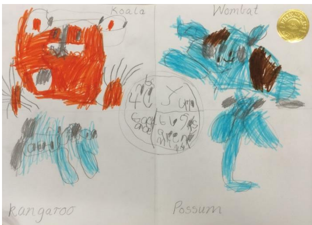
Animals with pouches by Mack Kilmartin (PP)