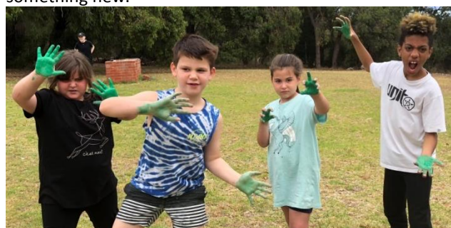
Before: This team were ready for action.