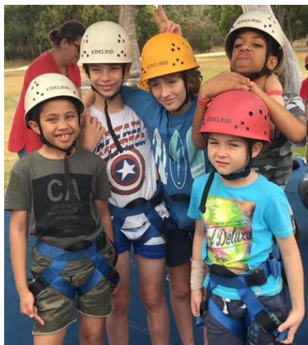
Face our fears? Deaf kids CAN!! This group can't wait to conquer the flying fox.