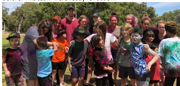
After: Everyone had a great time in this messy challenge, making for this awesome group shot.